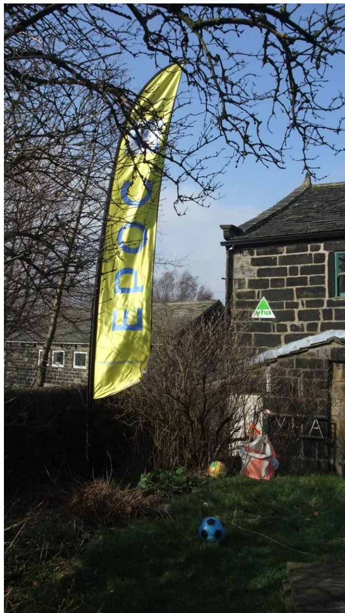
Spring arrived just in time for Stoodley Pike